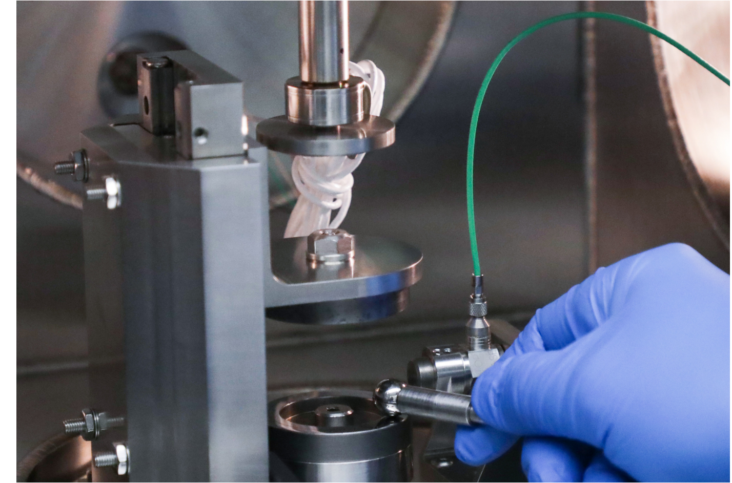
Figure 1: Spiral Orbit Tribome

The Knudsen method is used to determine a lubricant's vapor pressure (VP) and requires a very small sample, reducing testing costs and efficiency. The sample is placed in a small, capped cell with an orifice in the cap of known diameter. The cell is then placed in one of the vacuum chambers, at a desired temperature and duration. The mass loss from the lubricant is factored into the Knudsen equation, along with the other known variables of temperature and time, to calculate the Knudsen VP of that material at that temperature.